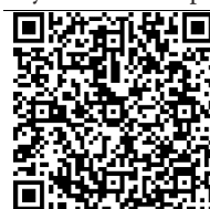
Residency & Fellowship Interest