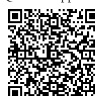
Residency & Fellowship Qualified Applicants